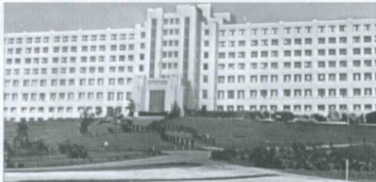
Tope de Collantes Hospital