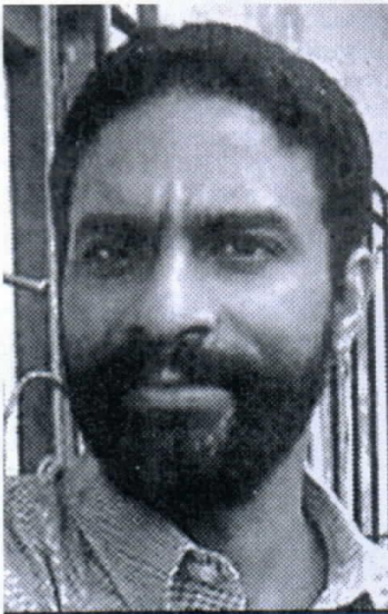
Dr. Oscar Elías Biscet

The Miami Medical Team Foundation has been sending medications and all help possible to Independent pro Democracy Groups, but this year is imperative that our effort increases the humanitarian programs to these groups and try to reconstruct the civil Society.