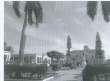
La Covadonga Clinic