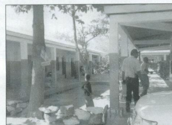
Fort Liberté Hospital Haiti, March 2001